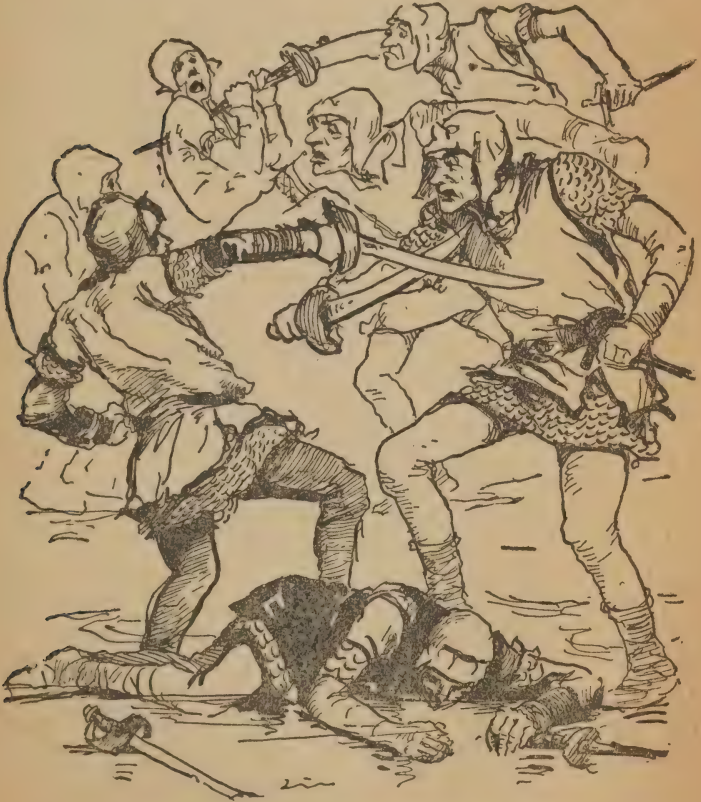
The affray became a series of single combats.

But the time passed, and still there was no movement. From quarter of an hour to quarter of an hour the same signal passed about the garden wall, as if the leader desired to assure himself of the vigilance of his scattered followers; but in every other particular the neighbourhood of the little house lay undisturbed.